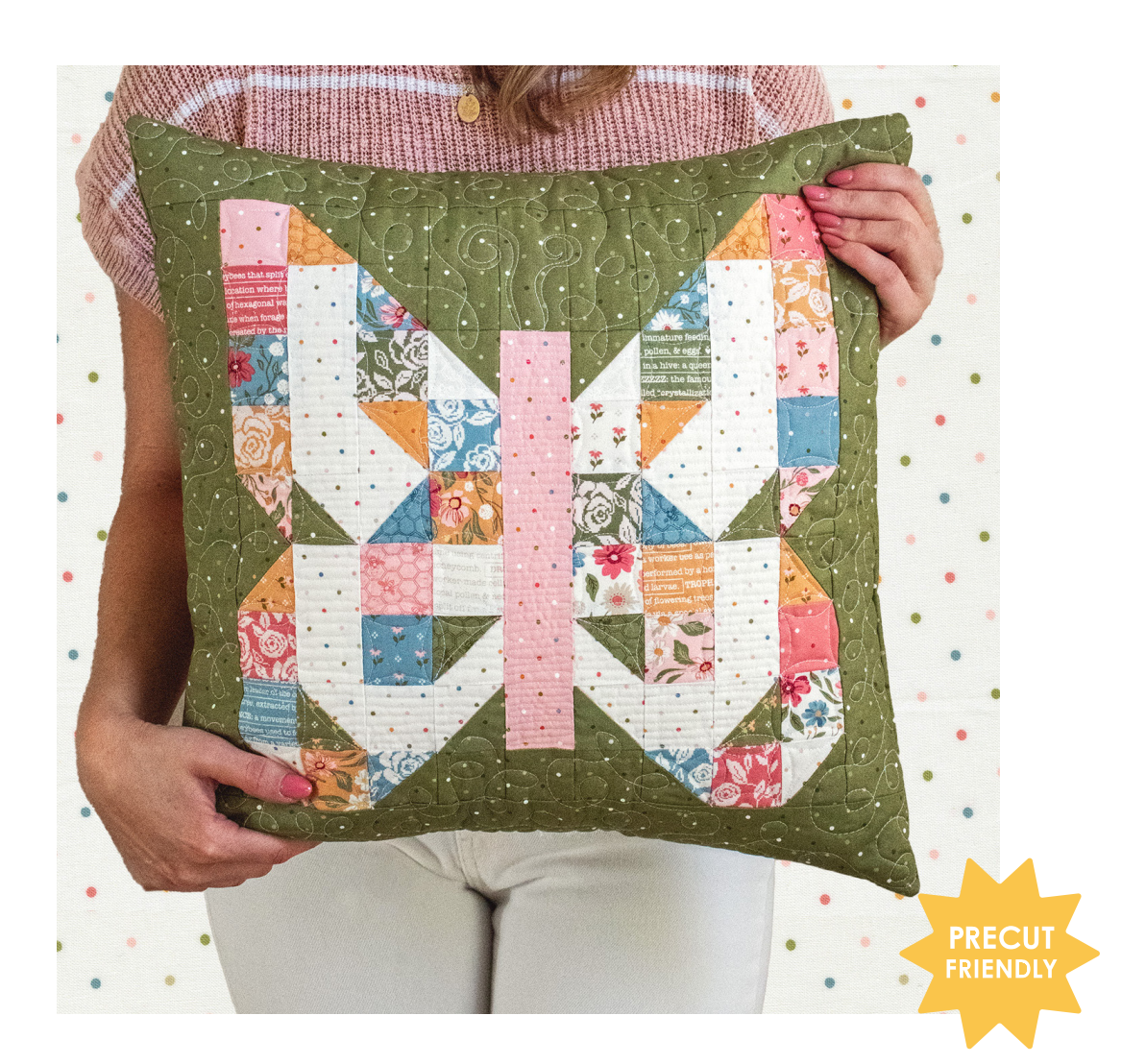
Mini Charmed by Lella Boutique LB 249 • 17 1/2" x 17 1/2" • Retail $10.00