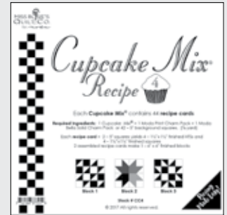
Cupcake Mix Recipe 4