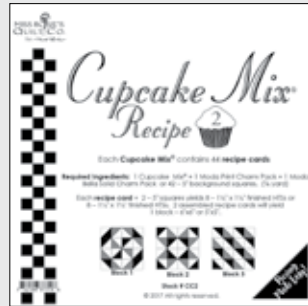
Cupcake Mix Recipe 2