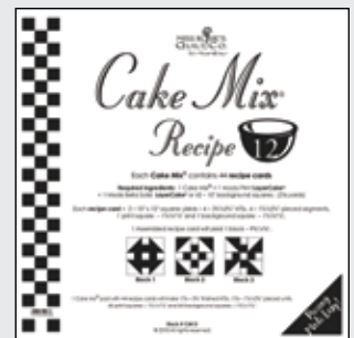
Cake Mix Recipe 12 Stk# CM12 7 52106 44038 8