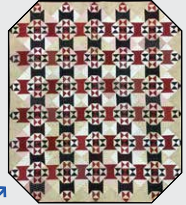
Use Stk# CM7 To Make This Quilt

Each tablet has 44 sheets – one for each layer in a Layer Cake or Charm Square – and a couple of extras for practice. Each pad also includes a few simple block and layout ideas – just add 1 or 2 Moda Layer Cakes or Charm Packs and you're ready to start stitching. There are twelve different Cake Mixes and four different Cupcake Mixes available... Check the Moda Fabrics website for free Cake Mix recipes like this one.