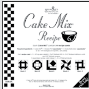
Cake Mix Recipe 6 Stk# CM6 7 52106 37349 5