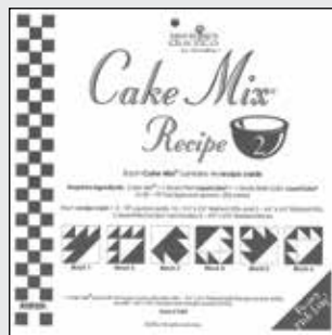
Cake Mix Recipe 2 Stk# CM2 7 52106 34489 1