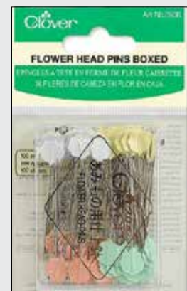
100 Pins .7mm - 2" long

Flower Head Pins Stk# 2506 Pack 6 Retail $13.95