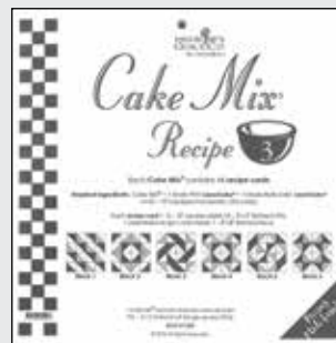
Cake Mix Recipe 3 Stk# CM3 7 52106 34490 7