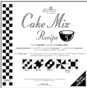
Cake Mix Recipe 5 Stk# CM5 7 52106 37348 8