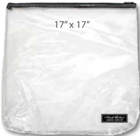
Clear Bag w/Zipper 17" x 17"

These bags will hold your layer cakes, charm packs and Recipe cards. With 5 sizes to choose from your projects will be organized in no time!