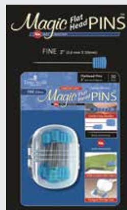
50 Pins .6mm - 2" long

Flower Head Pins Stk# 219928 Pack 1 Mult 2 Retail $11.99