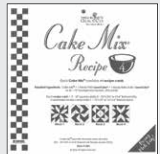
Cake Mix Recipe 4 Stk# CM4 7 52106 34491 4