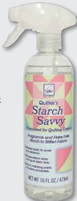
Starch Savvy 16oz Spray Bottle