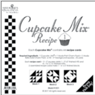
Cupcake Mix Recipe 1