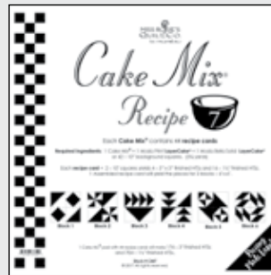
Cake Mix Recipe 7 Stk# CM7 7 52106 37350 1