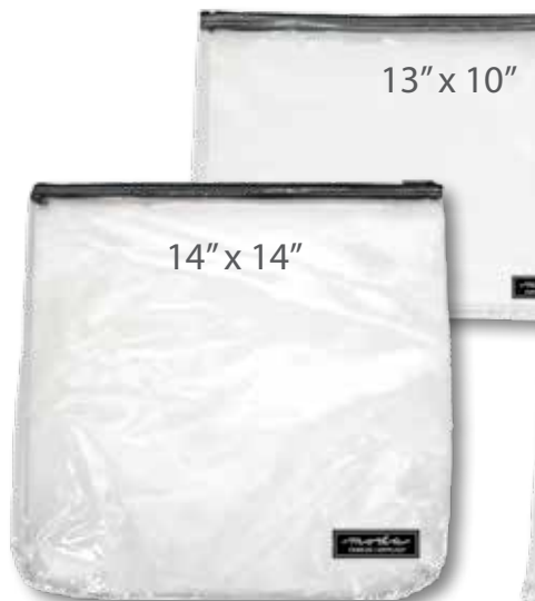
Clear Bag w/ Zipper 14" x 14"