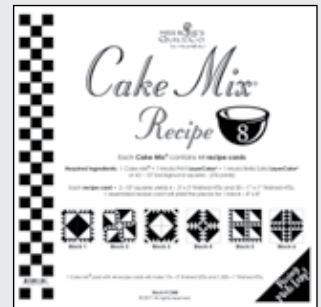
Cake Mix Recipe 8 Stk#CM8 7 52106 37351 8