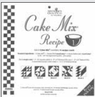
Cake Mix Recipe 1 Stk# CM1 7 52106 34488 4