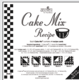
Cake Mix Recipe 11 Stk# CM11 7 52106 44037 1