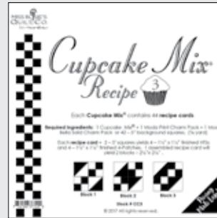
Cupcake Mix Recipe 3