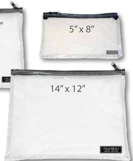
Clear Bag w/ Zipper 14" x 12"