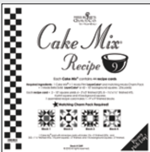
Cake Mix Recipe 9 Stk# CM9 7 52106 44035 7