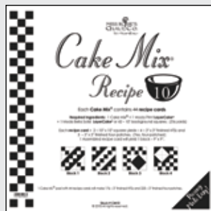
Cake Mix Recipe 10 Stk# CM10 7 52106 44036 4