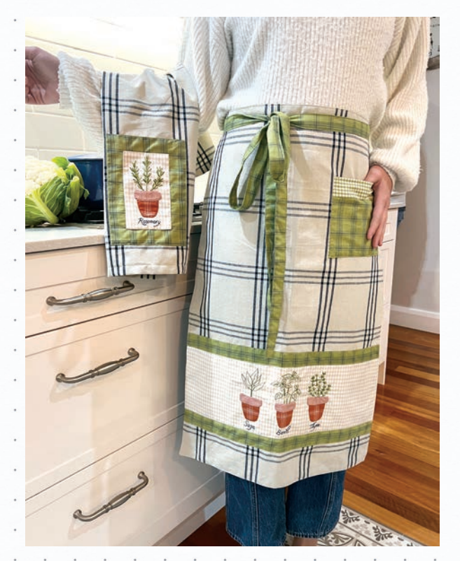
PTT 264 Herb Garden Apron 18" x 28" & Towel 19" x 28"

Vista's woven stripes and checks will add texture, dimension and directionality to quilts and other projects. The variety of scale in this collection provides versatility and individuality for your