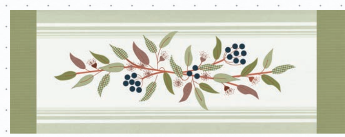
PTT 259 Blue Gum Runner Green Colorway 18" x 50" Red Colorway also available

With thirty woven fabrics to choose from, combined with twelve 18" wide towelings to create coordinating pillows, table runners and more, whatever project you choose to stitch, this line will combine to create your own beautiful vista.