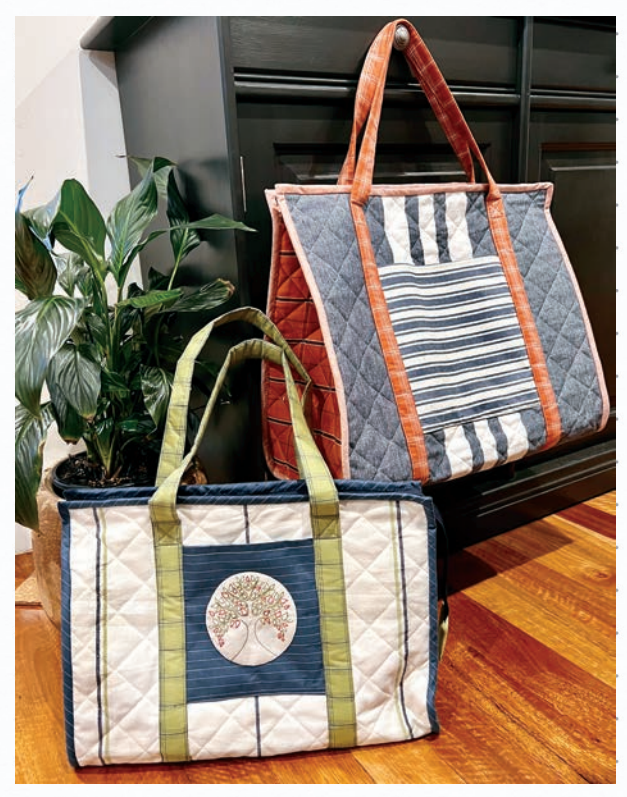
PTT 262 Tree Change Bags 18" x 16" x 9" & 16" x 12" x 6"