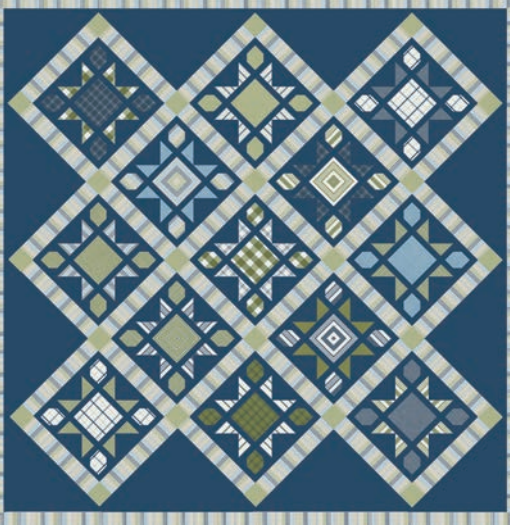
PTT 255 Scenic Trail 78" x 78" LC Friendly

PTT 260 Fern Table Centre Navy Colorway 33" x 33" & includes table mats 12" x 16" Additional colorways available