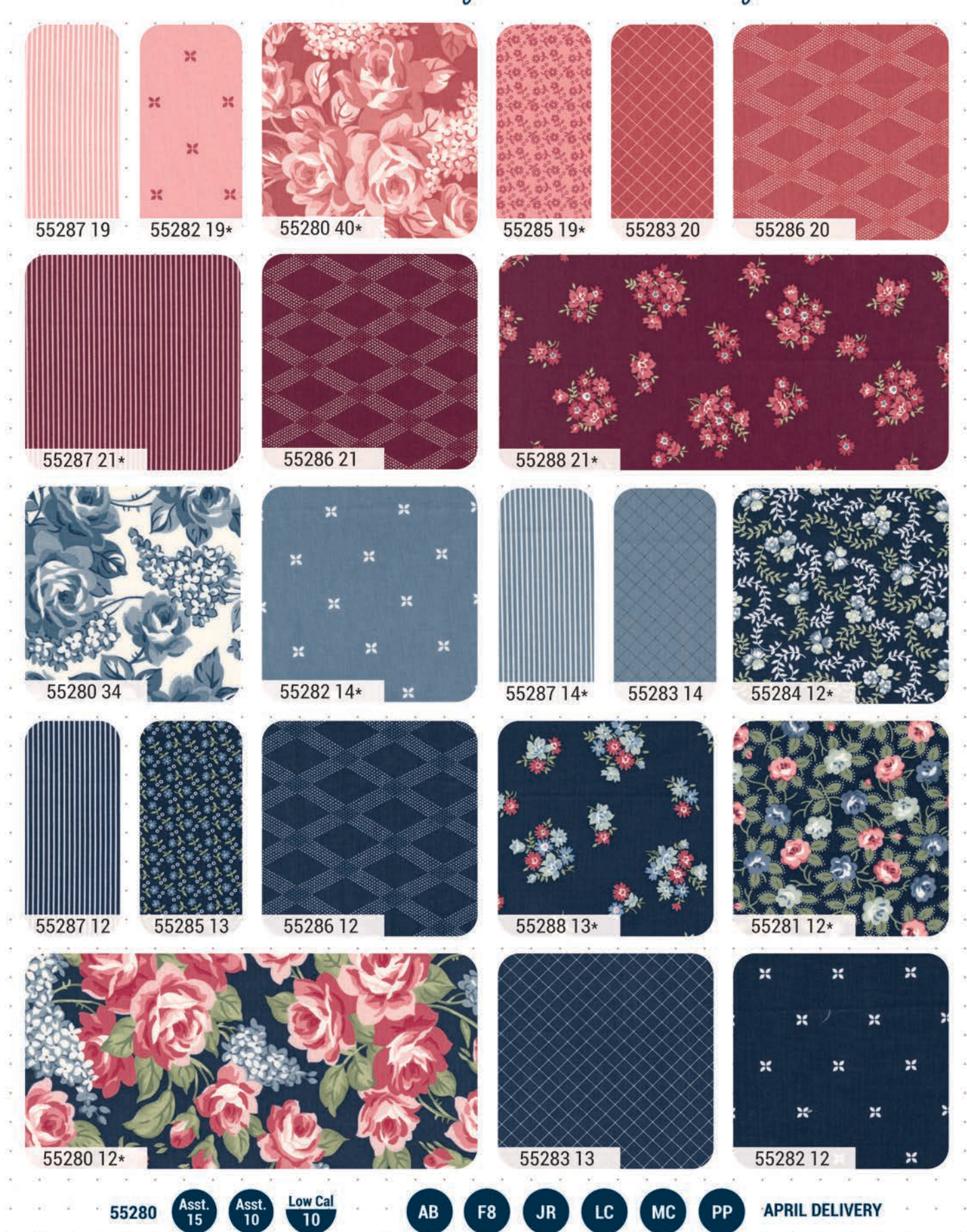
•40 Prints •100% Premium Cotton