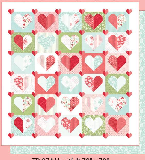
TB 274 Heartfelt 70" x 73"