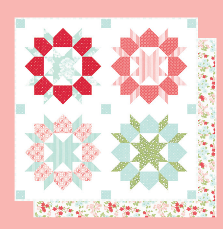
TB 170 Mini Swoon 19" x 19"