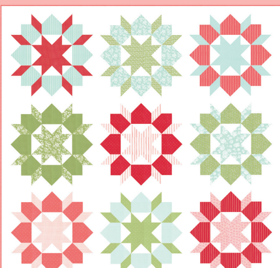
TB 277 Swoon 80" x 80"