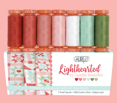
CR50LC7 Aurifil Thread Box 7 Spools Moda Exclusive!