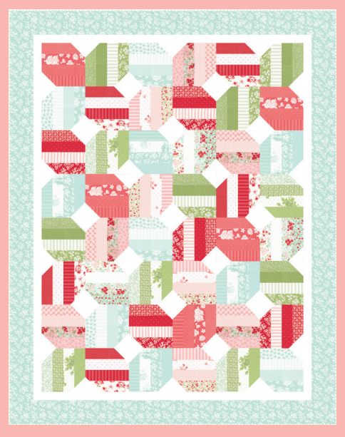
TB 276 Jellybeans 60" x 76" JR Friendly Additional version available