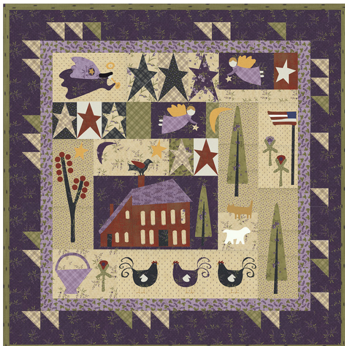
JPQ 2257 Down On The Farm 56" x 56"

Iris and Ivy is about "home". My mother's garden had lavender irises she'd received from my grandmother, Laird, irises that now bloom every spring in my garden. With ivy covering the front of our little brick house, Iris and Ivy means home.