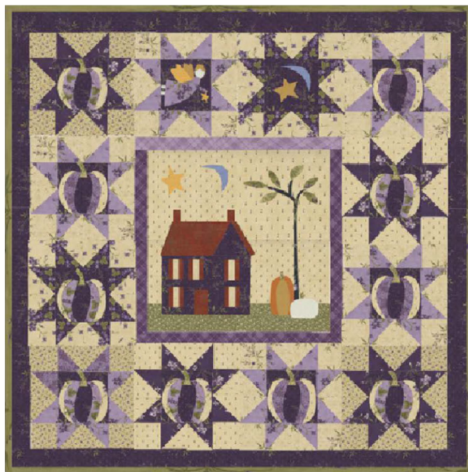
JPQ 2258 Purple Pumpkin Patch 46" x 46"