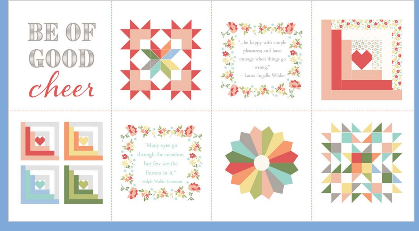
37637 11 Panel is 24" x 44". Blocks are approx. 11" x 12".