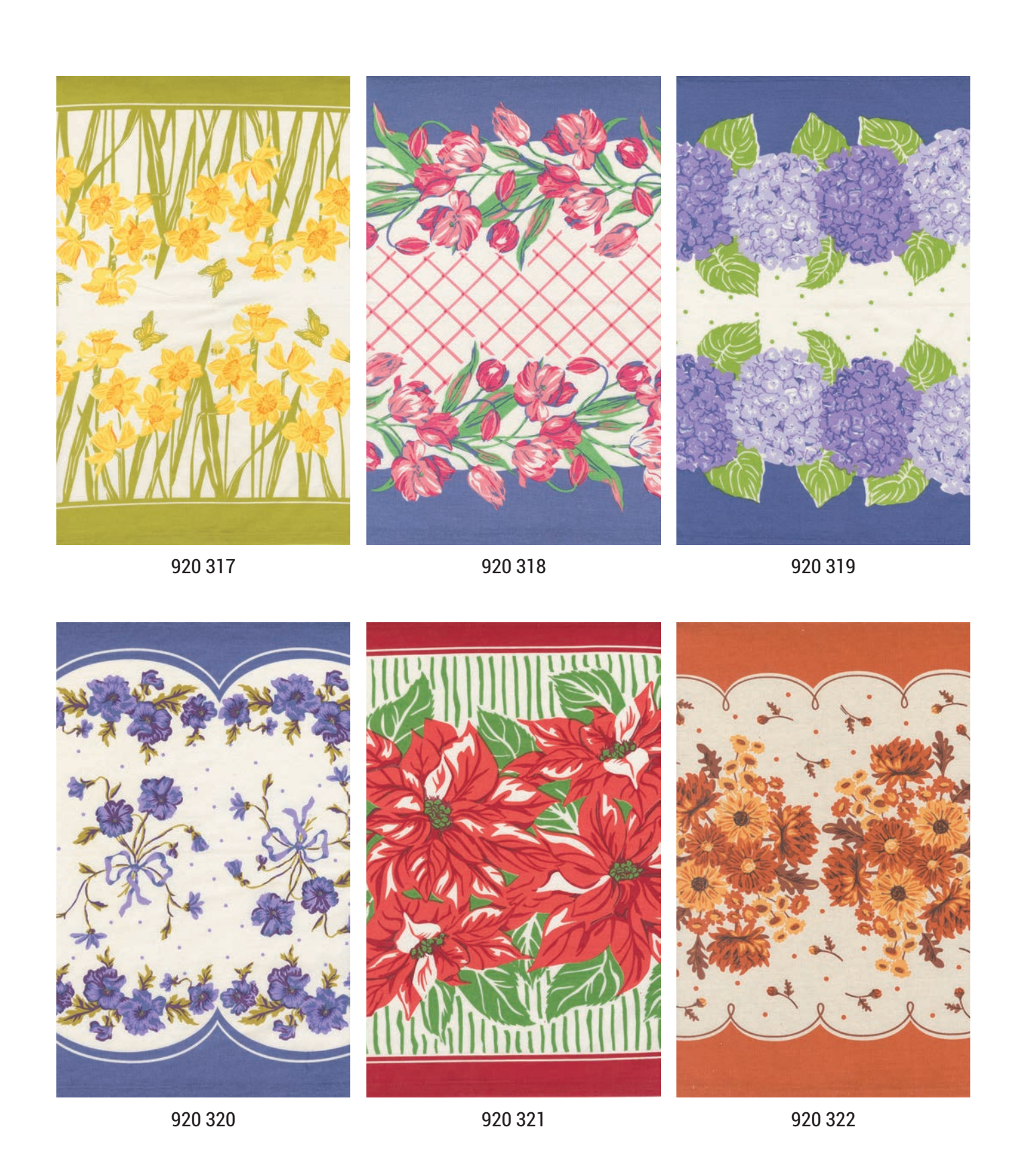
•6 16 Inch Cotton Toweling Prints •100% Cotton Toweling SEPTEMBER DELIVERY