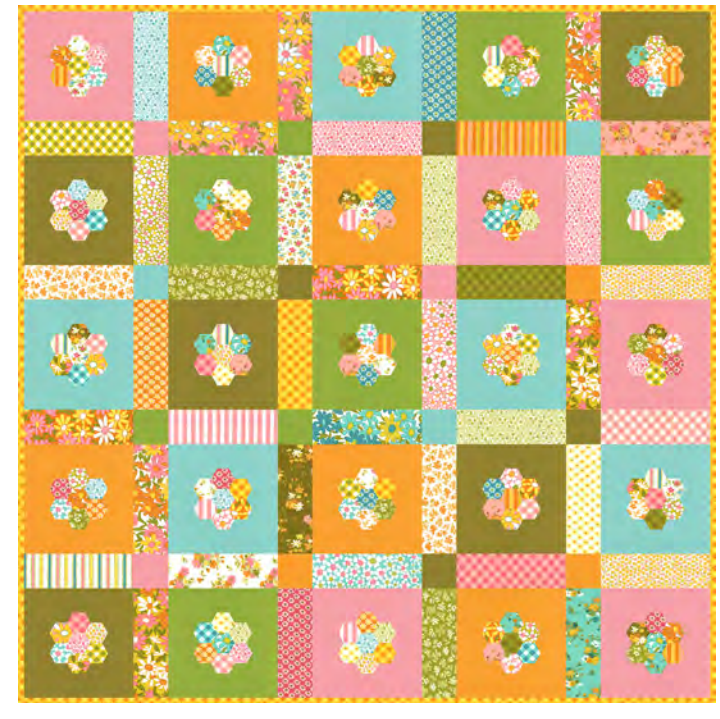
Web Pattern - Blooming Flower Boxes 59" x 59" HC Friendly