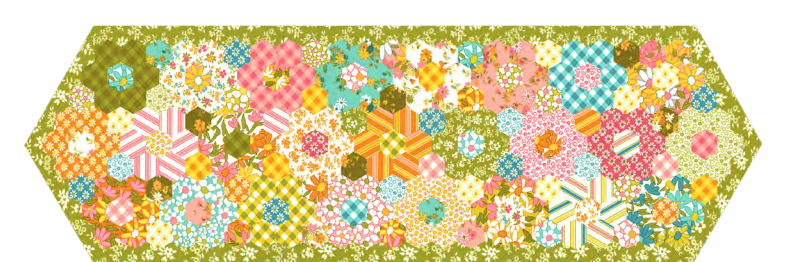
Web Pattern - Groovy Hexie Runner 16" x 49" HC Friendly