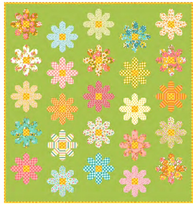
PPP 18 - Fresh As A Daisy 59" x 63"