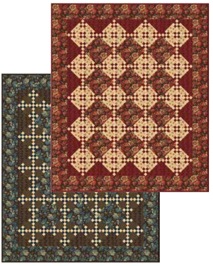
BCD 1303 Nantucket Blue 63" x 76"