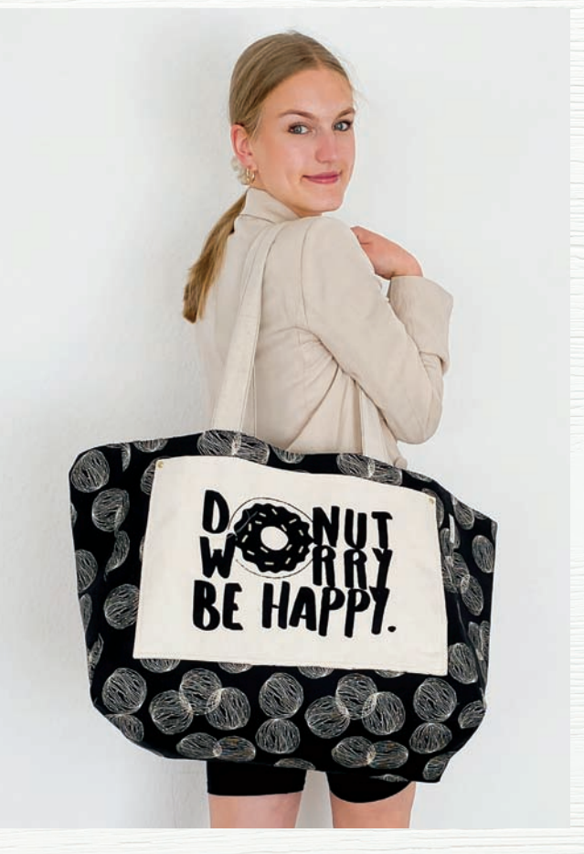
ZC YDBP You Decide 20" x 14" x 9"