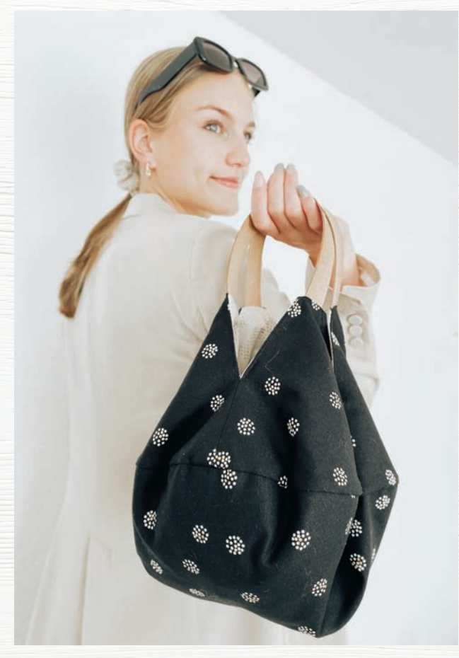
ZC ORBP Origami 20" x 20"