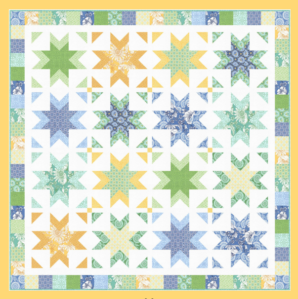
WS 30 Sparklers 60" x 60"