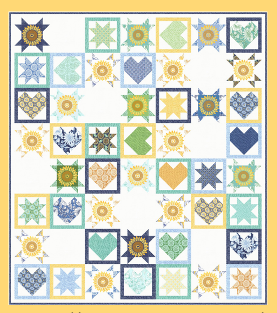
CHD 2307 Sunshine In Our Hearts 72" x 82" LC Friendly