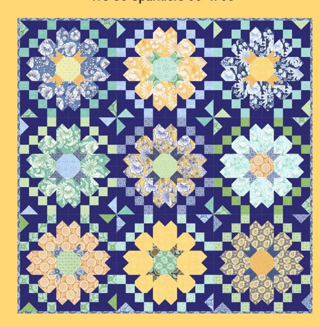
KS 2302 Kismet 61" x 61" AB Friendly