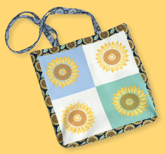
PS27320 The Sunshine Tote 18" x 18" Embellish with Aurifil Thread!