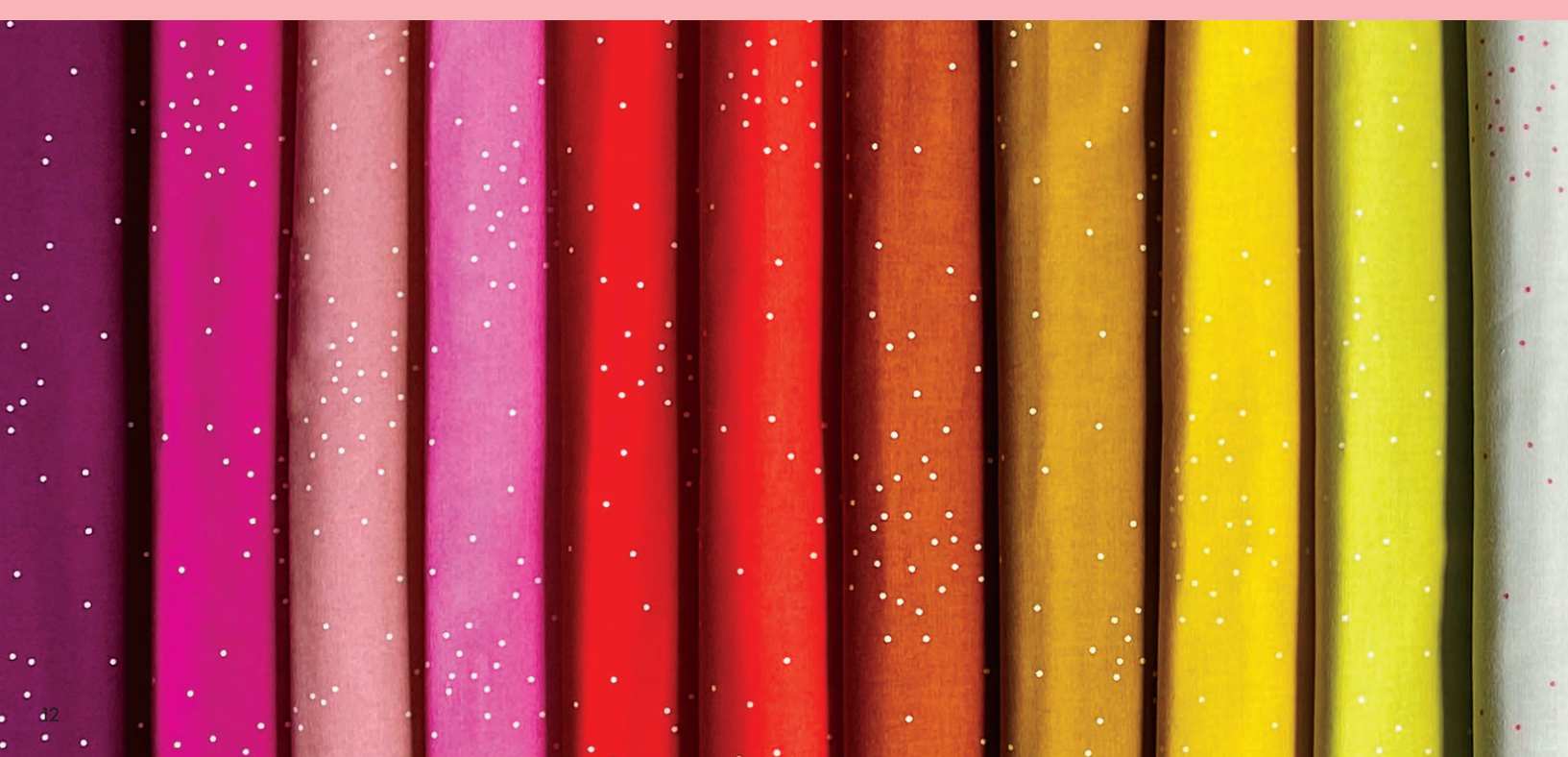
WCS 002 Whole Circle Studio - Bzzzzz