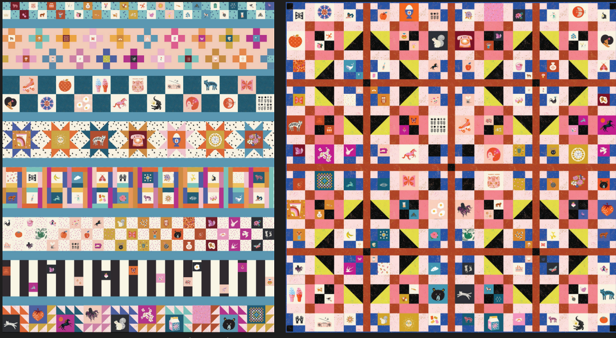
AQD 0297 65" x 80"