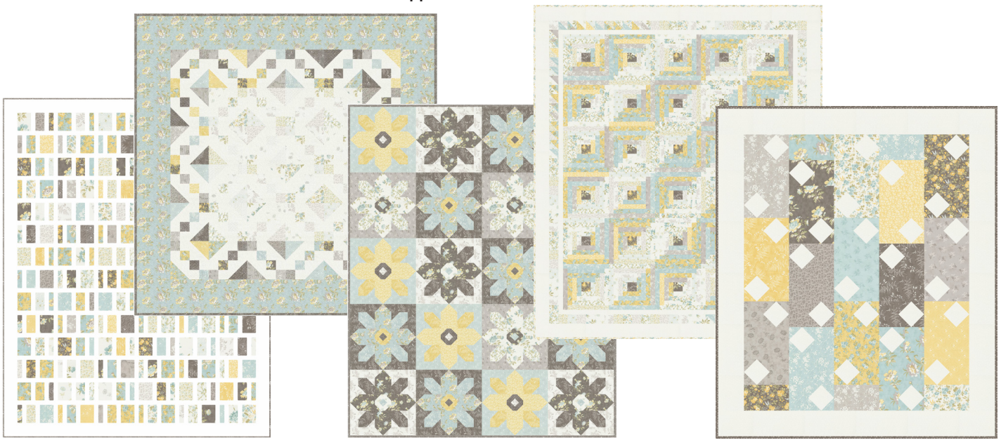
BNB 2309 Carolina Shag 59" x 75" by Chirssy Lux of Branch and Blume LC Friendly

PS 44340 Honeybloom 62" x 72" Low Cal Friendly