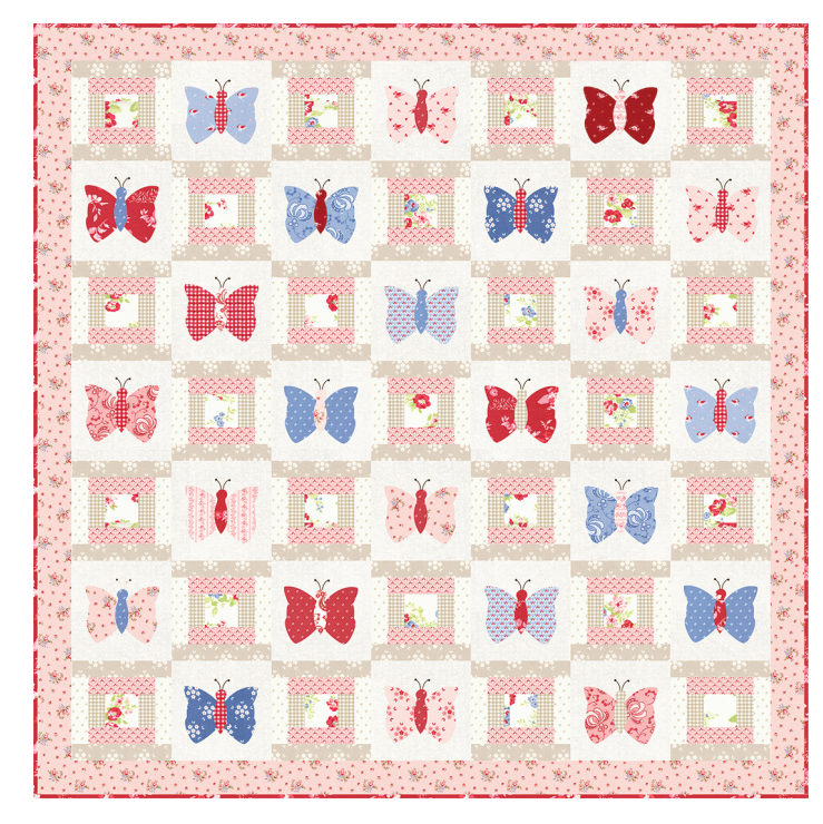
BHD 2202 Frequent Flyers 46 1/2" x 46 1/2" PP Friendly by Bunny Hill Designs