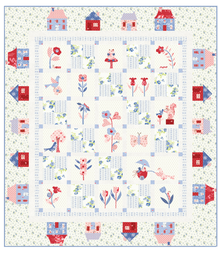
BHD 2200 Central Park 53 1/2" x 60 1/2" Row of the Month 8 Months by Bunny Hill Designs