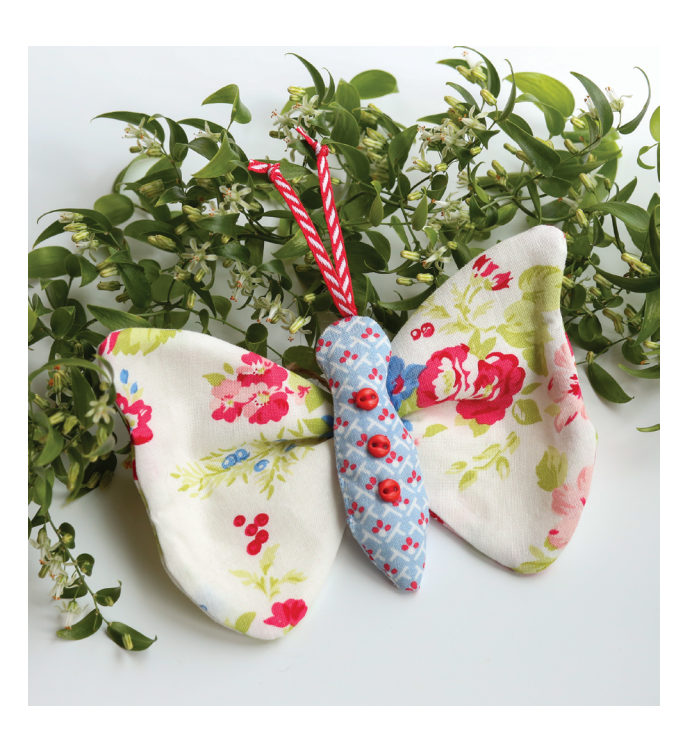
BHD 2203 Iris 5 1/2" x 4" by Bunny Hill Designs