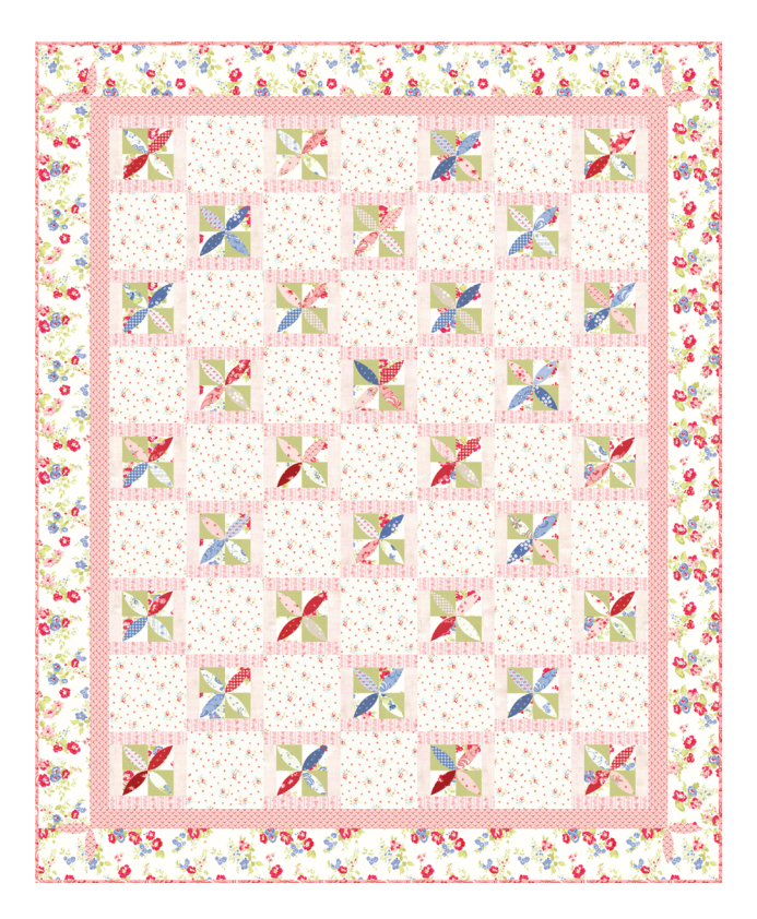
BHD 2201 Rainbow Sherbet 53 1/2" x 65 1/2" PP Friendly by Bunny Hill Designs