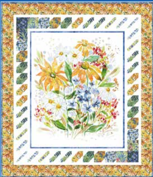
CJP 2103 Garden Dreams 54" x 62"