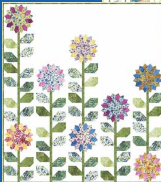
CJP 2101 Reach for the Sun 64" x 72"