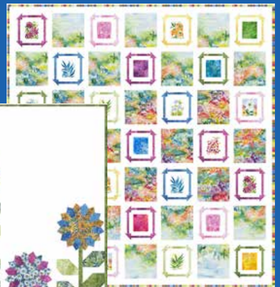
CJP 2104 Meadows 61" x 65"