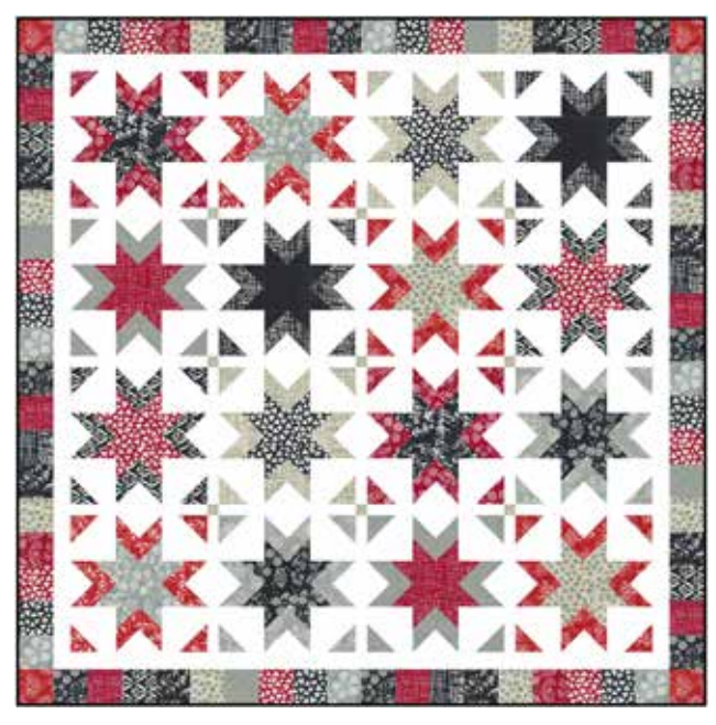
WS 30 Sparklers 60" x 60"