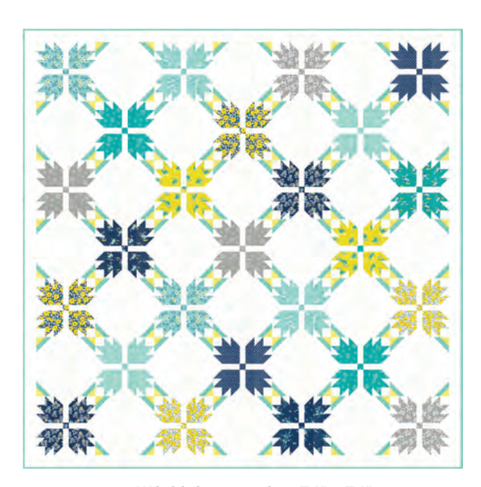
WS 62 Summer Sun 74" x 74"