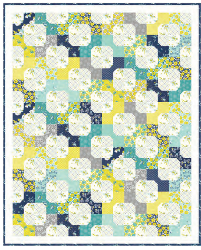
CSQ 115 Summer's View 52" x 64" AB Friendly