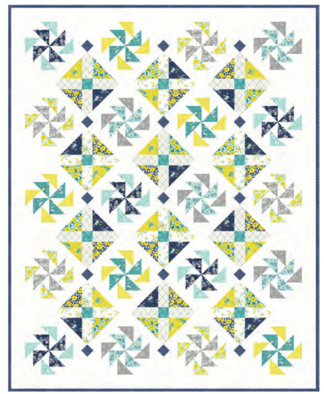
CSQ 114 Sail On 53" x 67"