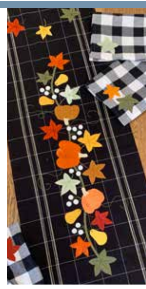
PTT 241 Autumn Living Table Runner 18" x 50"