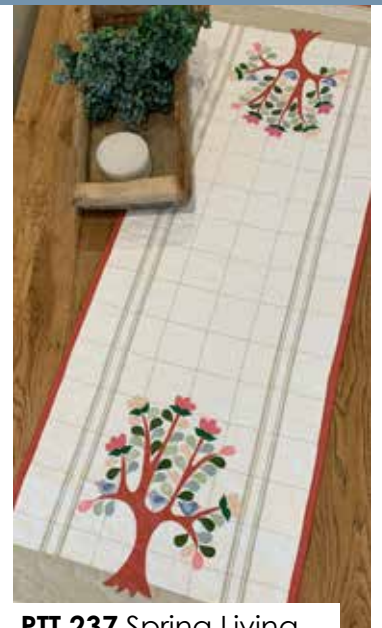
PTT 237 Spring Living Table Runner 18" x 56"