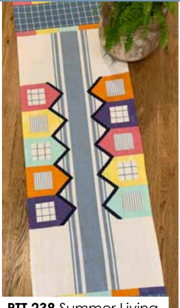
PTT 238 Summer Living Table Runner 18" x 60"