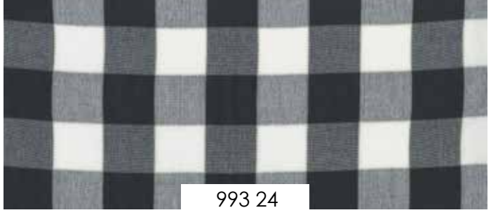
993 •60" Toweling 2 Wovens •100% Cotton Toweling