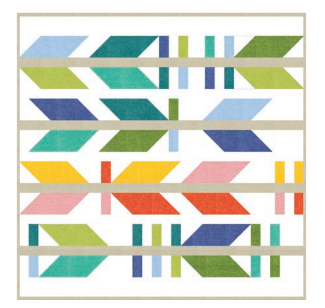
RPQP AM166 The Arrow Maker 59" x 59" DR Friendly

and freedom to them. This Dotty Thatched release brings 20 colors including popular basics like Navy, Royal, Scarlet, Tangerine, Blizzard, Shadow, Gray, Fuchsia and Washed Linen. Enjoy a charming new Sunshine Yellow that brings happy feelings with Princess Pink and Grass Green.