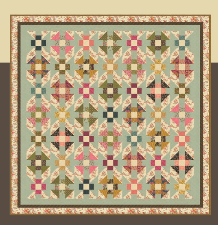
MWP 225 I'll Fly Away 67" x 67" F8 Friendly by My Wandering Path Also features fabric from Sagewood by Crystal Manning