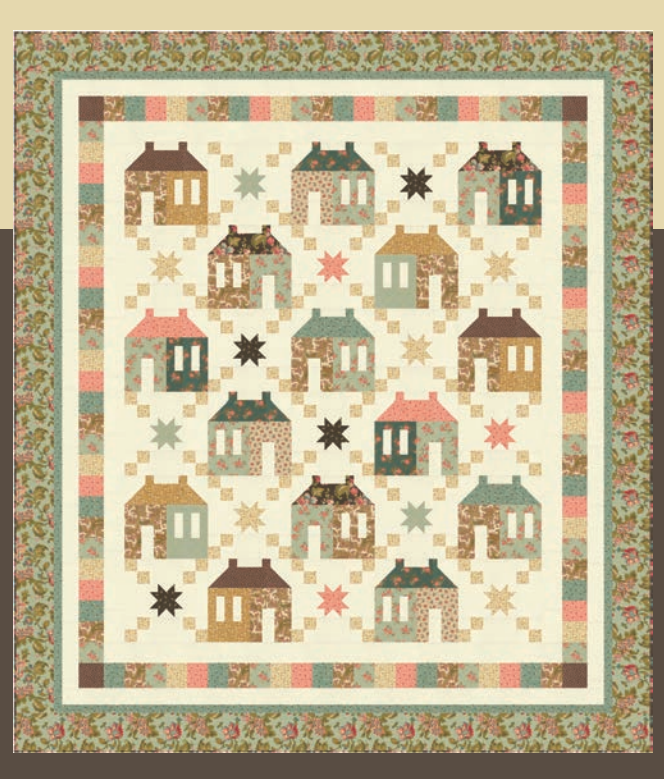
WS 03 Maisons de Patchwork 76" x 86" by Wendy Sheppard