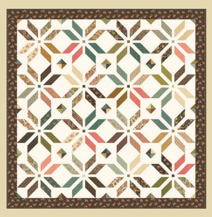
HQ 101 Summer Breeze 75" x 75" LC Friendly by Happy Quilting