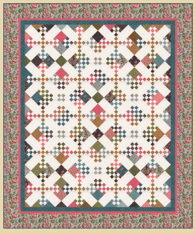
AQD 310 Nine by Nine 66" x 78" AB Friendly by Antler Quilt Designs