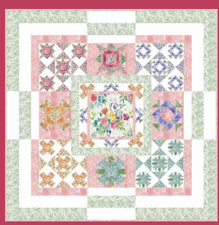
CJP 2108 A Beautiful Arrangement Light 78" x 78"