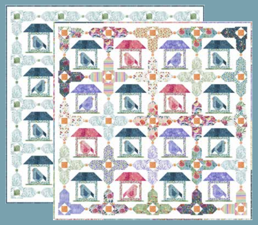
CJP 2106 Peep A Little, Talk A Little Multicolored 80" x 80"