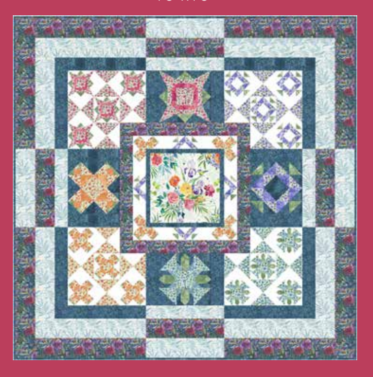
CJP 2108 A Beautiful Arrangement Dark 78" x 78"