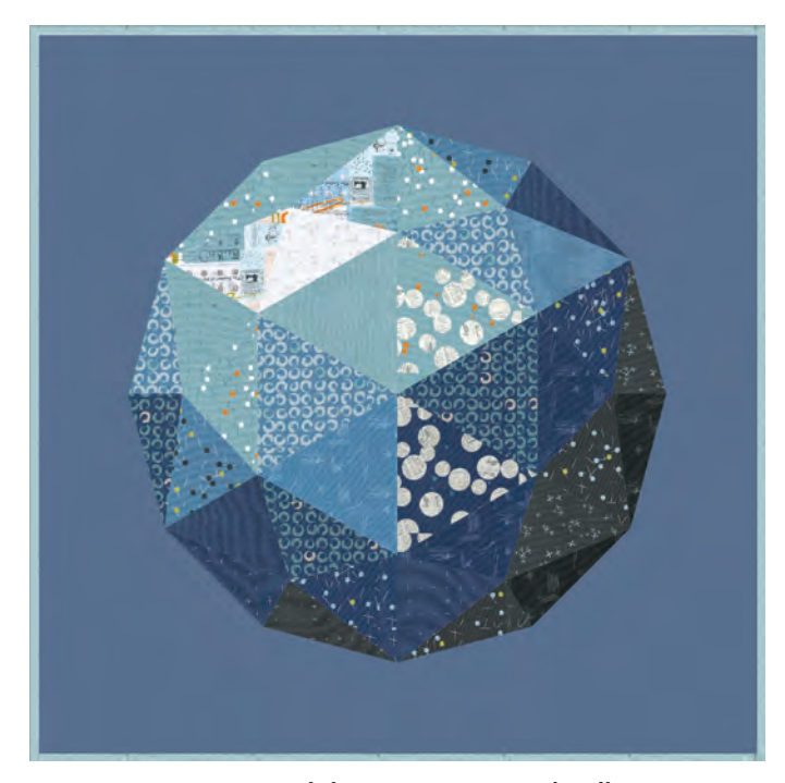
ZC GOQP Globe 41" x 41" LC Friendly