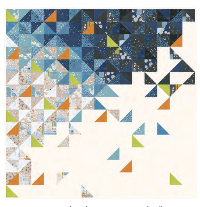
ZC TRQP Throwing 61" x 61" PP Friendly