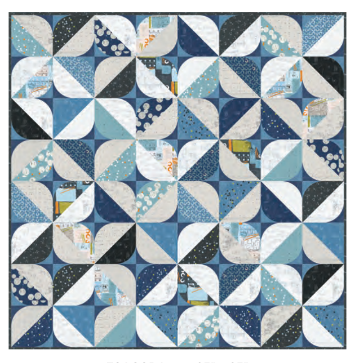
ZC LOQP Lotus 65" x 65"