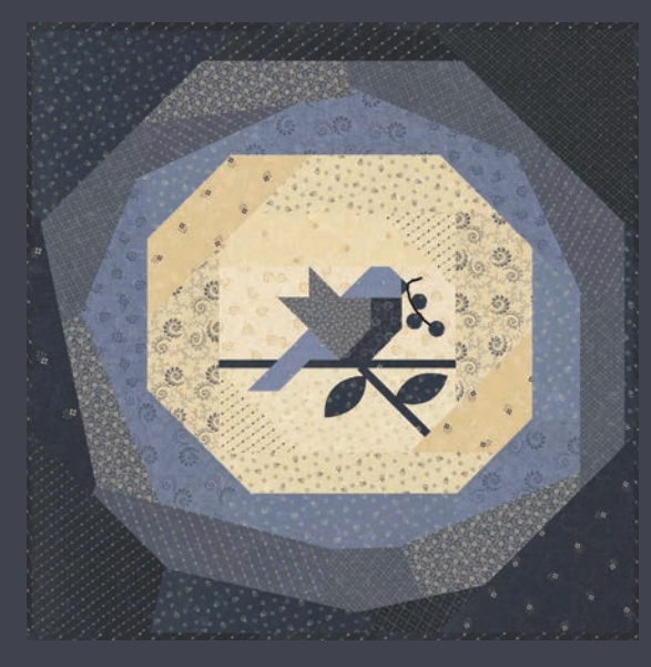
Nest 20" x 20" Only available with purchase of Collector Series Tin

MTIN9800 Kansas Trouble's Bluebird's Nest Tin