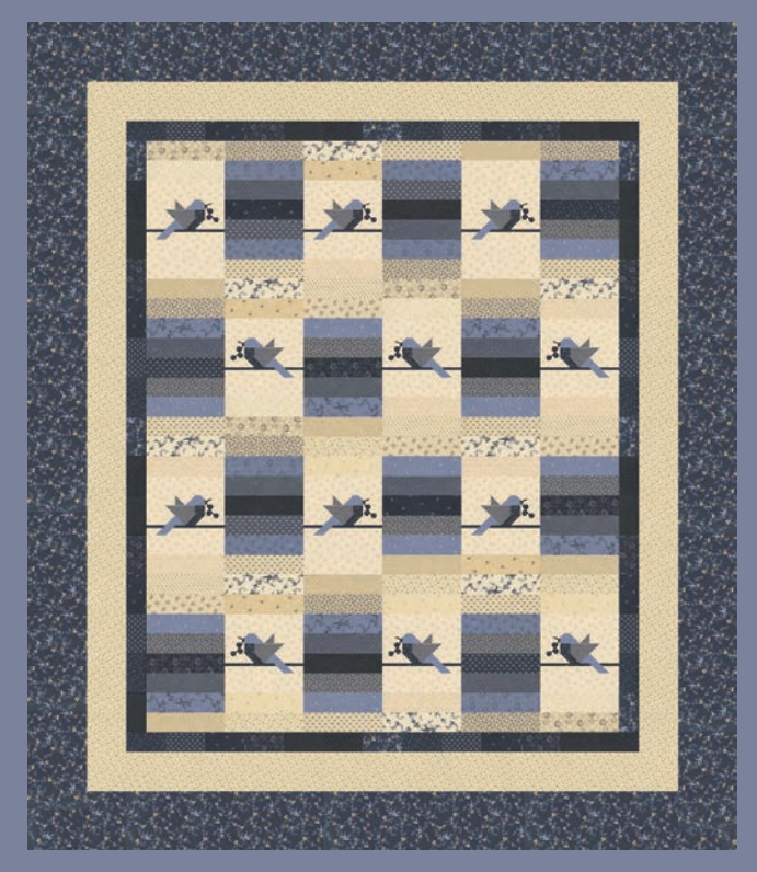
KT 25122 Choose Happiness 72" x 84" JR Friendly