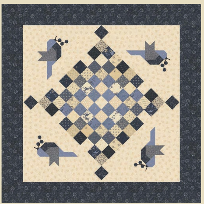
KT 33009 Bluebird Quartet 30" x 30" MC Friendly