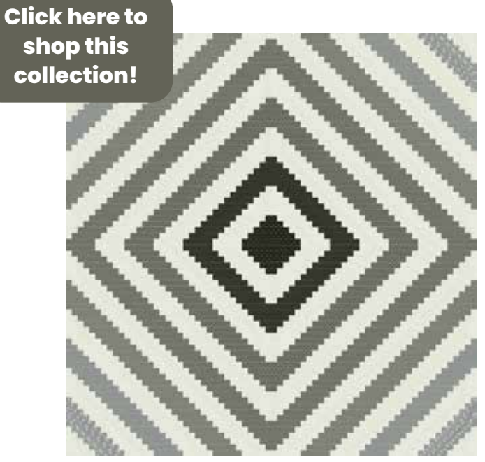
Cabins on the Ridge 70" x 72"

All projects are included in the book, Urban Patchwork Gatherings PRI 1010