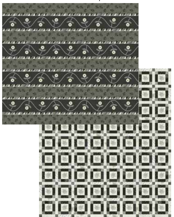
Clematis - 69" x 78"

Trellis Flower Garden 72" x 81" F8 Friendly