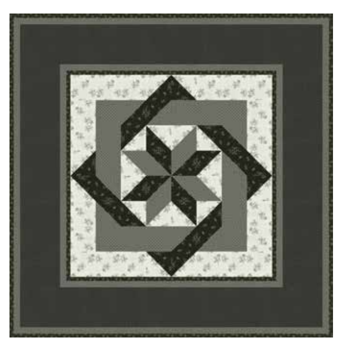
Interwoven Star - 77" x 77"