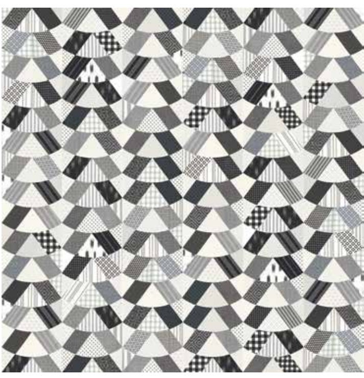
JKD 8670 Cloud Club 72" x 72" FQ Friendly Uses Cloud Club Tempter Template