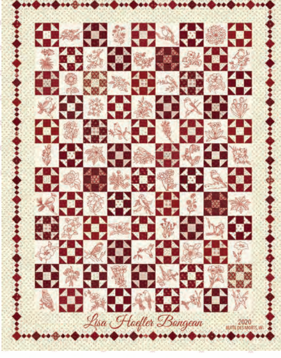
PRI 742 Redwork Quilt - 57" x 74"