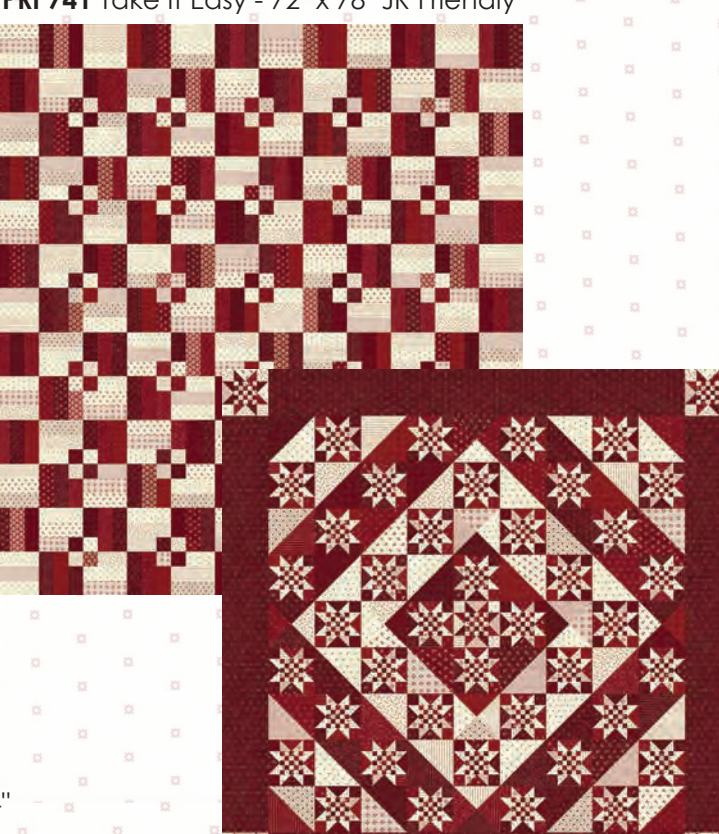
PRI 745 Long Long Way From Home - 44" x 44"