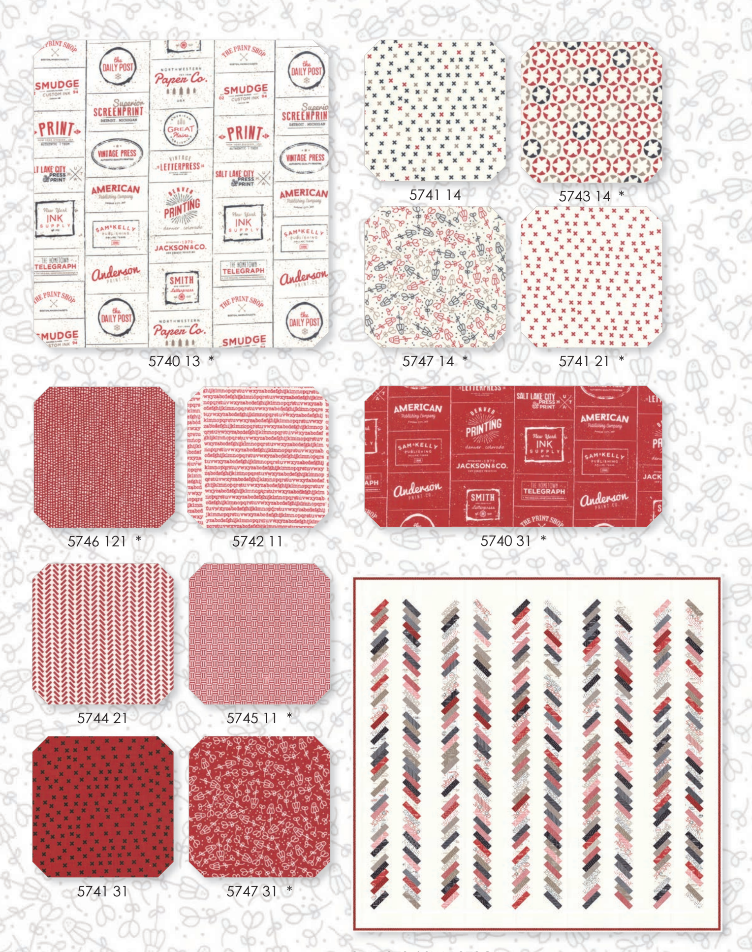
SW P270 / SW P270G Against the Grain Size: 69"x66" HB Friendly