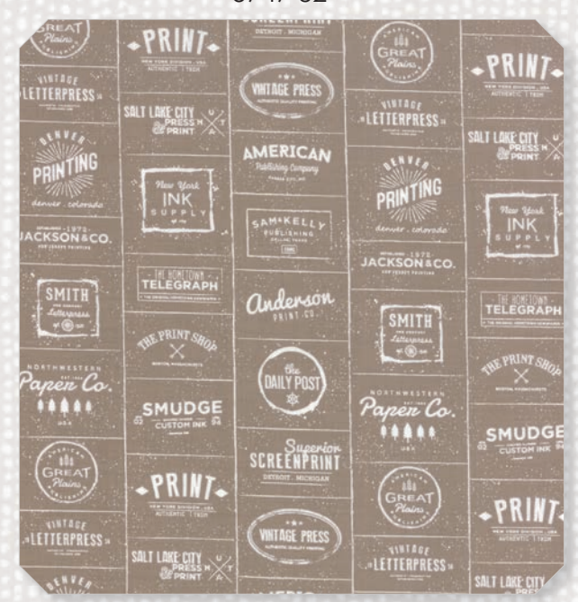
5740 32 *