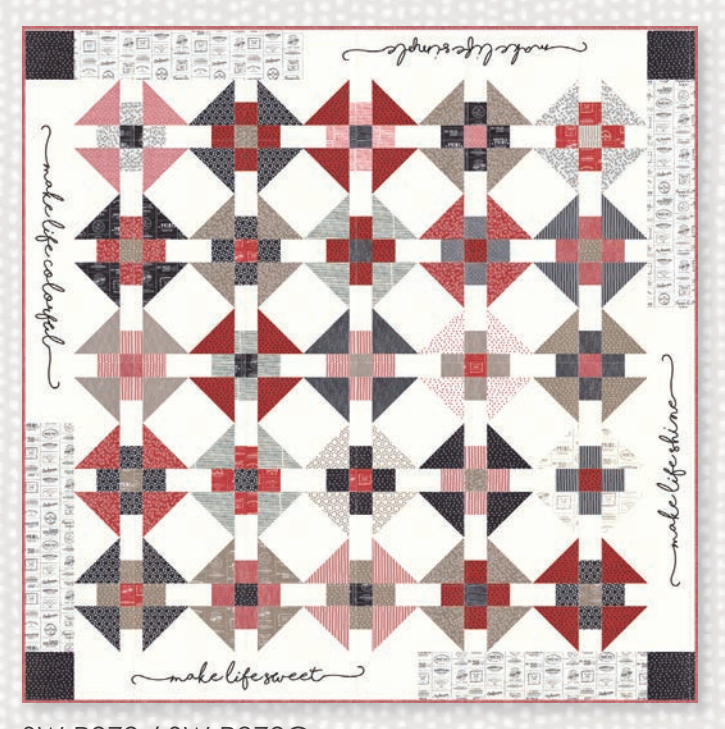
SW P272 / SW P272G Make Life Sweet Size: 59"x59" LC & PP Friendly