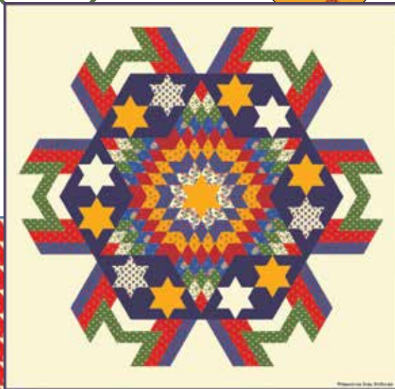
AJ 424 / AJ 424G Badge of Honor Size: 66" x 67"