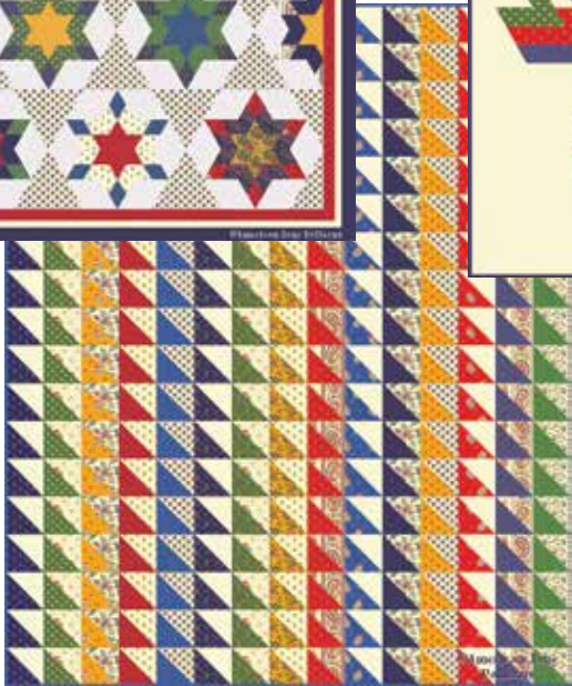
AJ 425 / AJ 425G Champs de Fleur Size: 75" x 90"