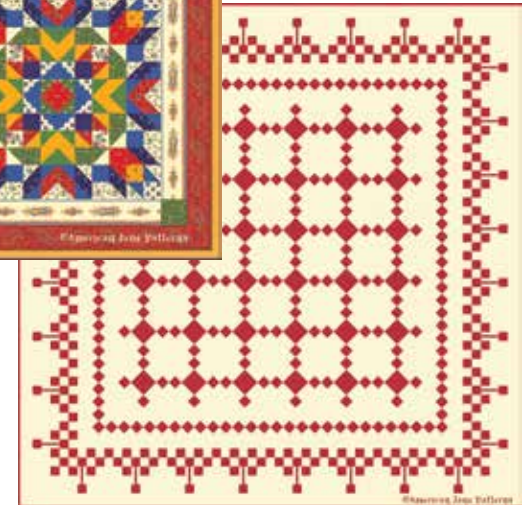
AJ 421 / AJ 421G Strawberries and Cream also available as AJ 422 Blueberries and Cream Size: 56" x 56"