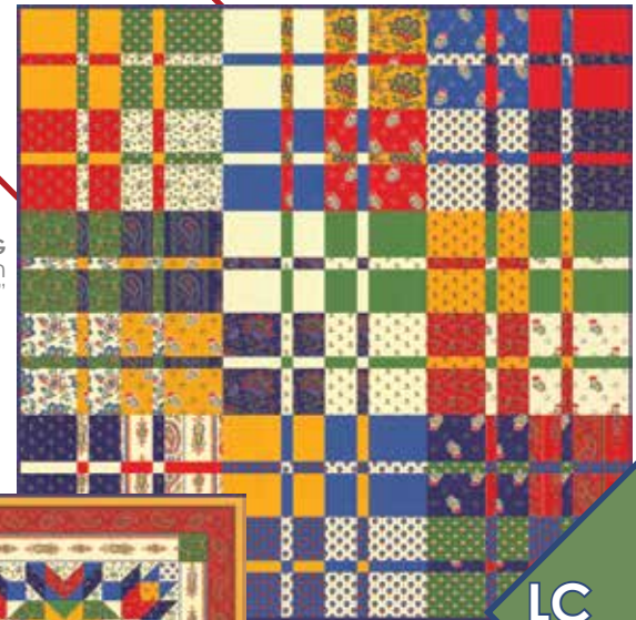
AJ 420 / AJ 420G The Plaid Won Size: 53" x 53"