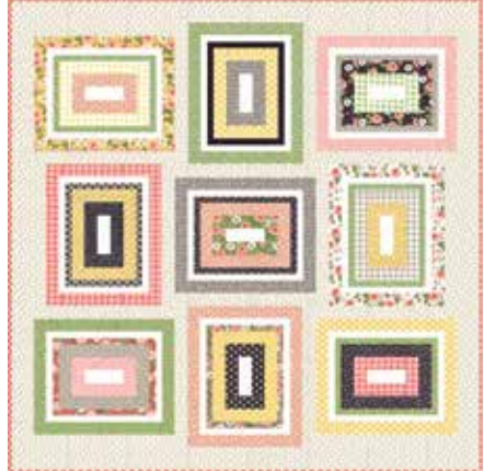
LB 160 / LB 160G Kith & Kin Size: 73" x 73"