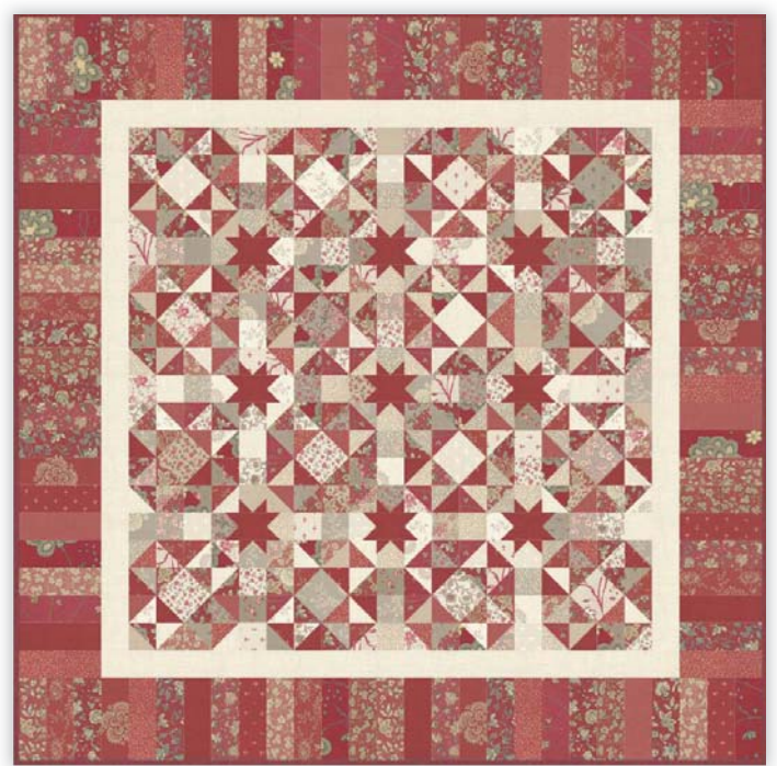
PSD 404P/ PSD 404PG Kaleidoscope of Stars Quilt measures 54" x 54"