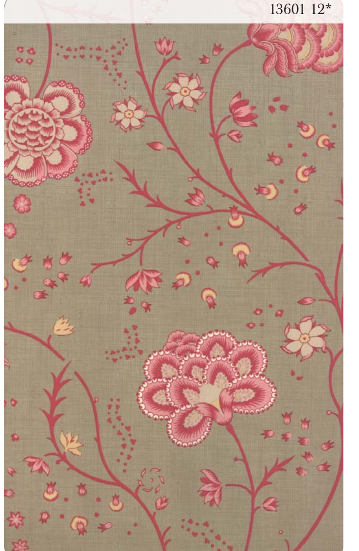
Reduced to 36% to show pattern