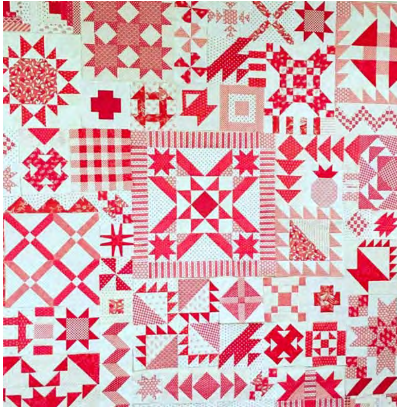
Susan Ache - Red & White Sampler, circa 2018. (She just started making blocks.)

Third - we will be sharing everything here, on Moda's The Cutting Table blog, every Wednesday morning. The Sampler Spree QAL posts will publish by 7:00 AM CST. Or you can sign up for e-mail delivery - The Cutting Table Newsletter . That starts sending shortly after 8:00 AM CST, but when you actually receive it will vary.