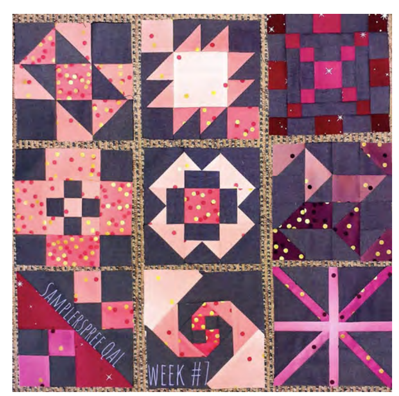
Anke Wechsung - <a>@patch-yard</a>.