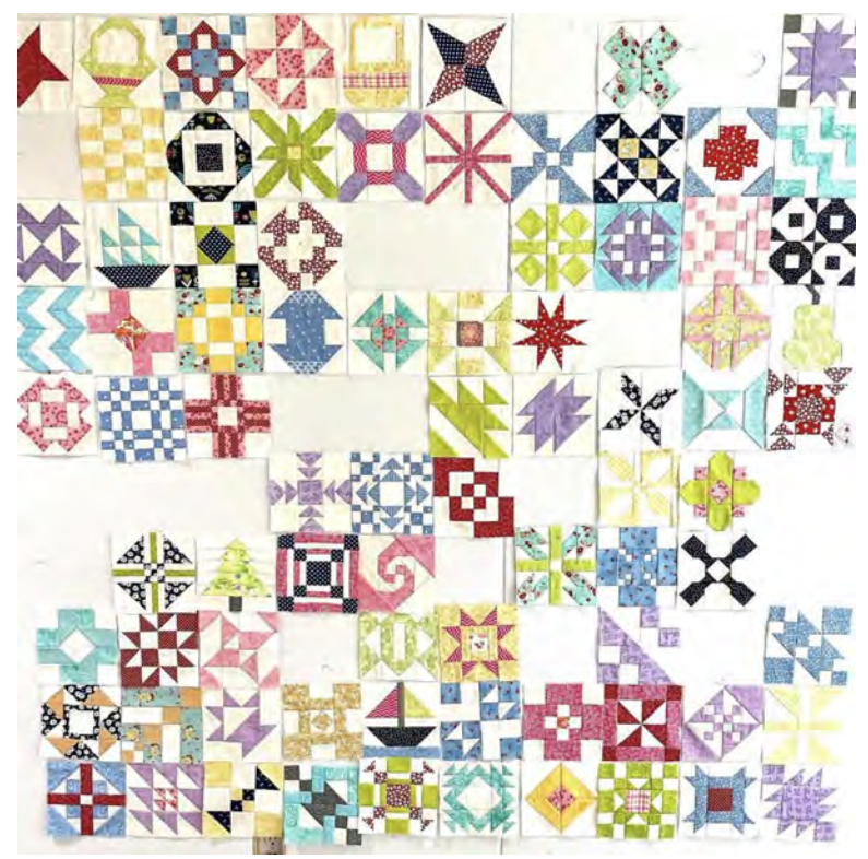
Anina - @twiddletails.