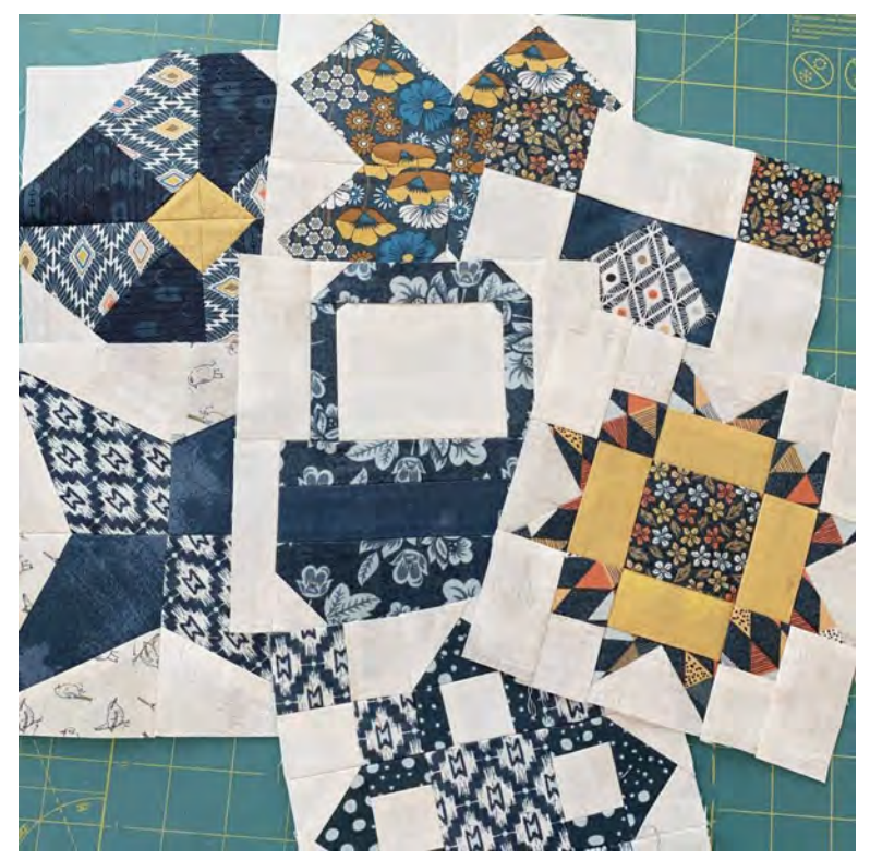
Nicole Reed - @sisterschoicequilts.