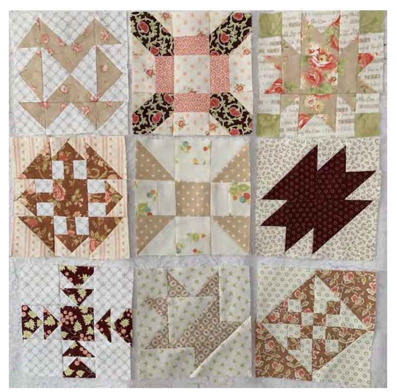
Lynda Hezemans - @lyndah2502.