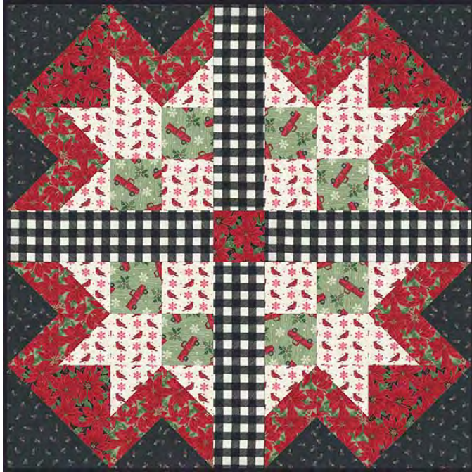
Home Sweet Holidays by Deb Strain. This version picks up on the striking poinsettia prints in the line and a more farmhouse look with the black and white gingham, for a cheery poinsettia inspired wreath rather than the usual green.