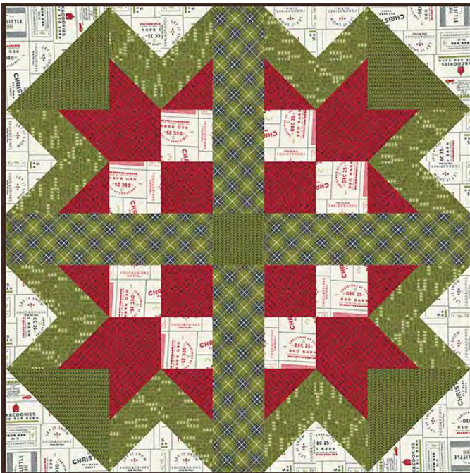
Red Barn Christmas by Sweetwater. Traditional Christmas colors with all those beautiful low volume prints for background options—with the size of these pieces, all of the light prints work!