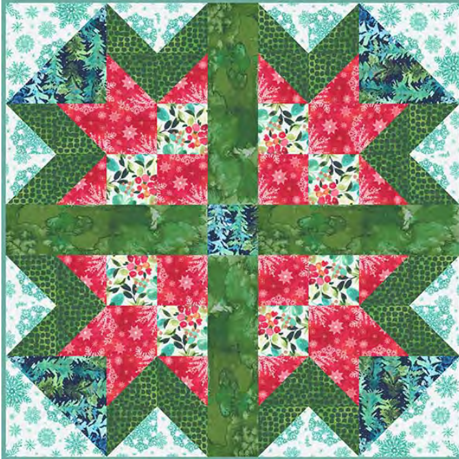
Starflower Christmas by Create Joy Project. The watercolor prints in this line make for a more modern take on a Christmas green, red and aqua palette.