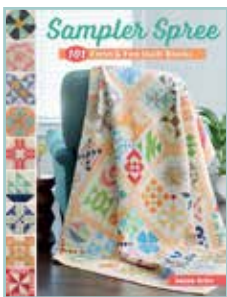
Sampler Spree Stock # B1566