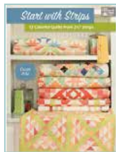
Start with Strips Stock # B1426