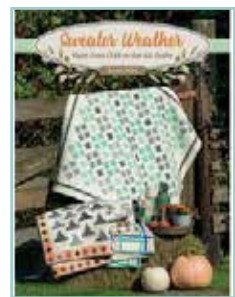
Sweater Weather Stock # B1527

Book available at your favorite book retailer or at www.shopmartingale.com