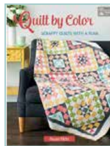
Quilts by Color Stock # B1518