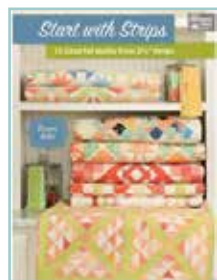
Start with Strips Stock # B1426