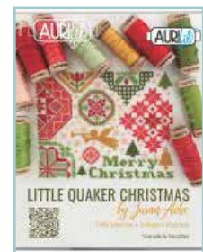
Aurifil Thread box Stock # Little Quaker Christmas

Ask for Susan Ache products from your favorite quilt or specialty retailer.