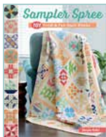
Sampler Spree Stock # B156