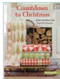
Countdown to Christmas Stock # B1486