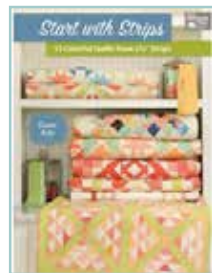
Start with Strips Stock # B1426