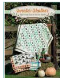
Sweater Weather Stock # B1527

Books available at your favorite book retailer or at www.shopmartingale.com