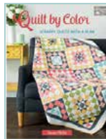
Quilts by Color Stock # B1518