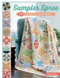
Sampler Spree Stock # B156